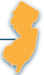
% of Students "Graduation Ready"